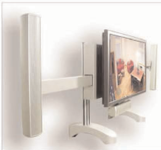
GDI Mesa - Double T Motorized Lift by Ginni Designs

Modern family rooms double today as media centers. The video signal can be sent to any room in the house from the same set of components while each video source can be controlled from any room through easy to use keypads or remotes.