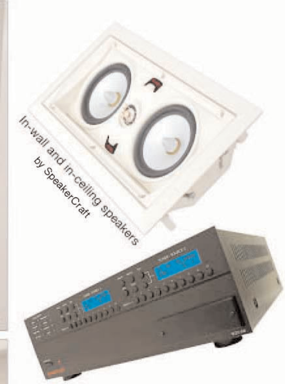
Whole House Control by SpeakerCraft